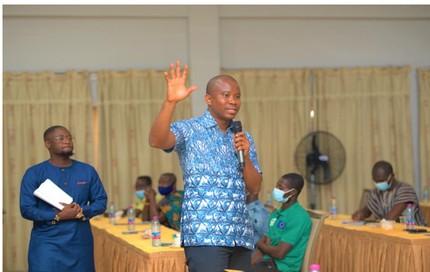
Figure 13: CDO Director addressing some questions

Question 8: The role of TCC was questioned in addition to knowing if there are any specific business development packages available to coconut vendors.