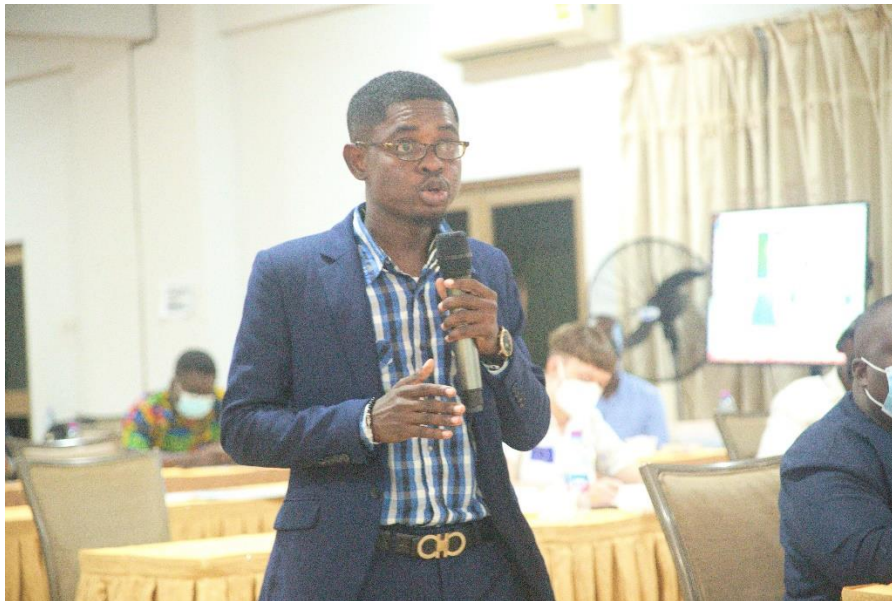
Figure 12: The project manager addressing some questions