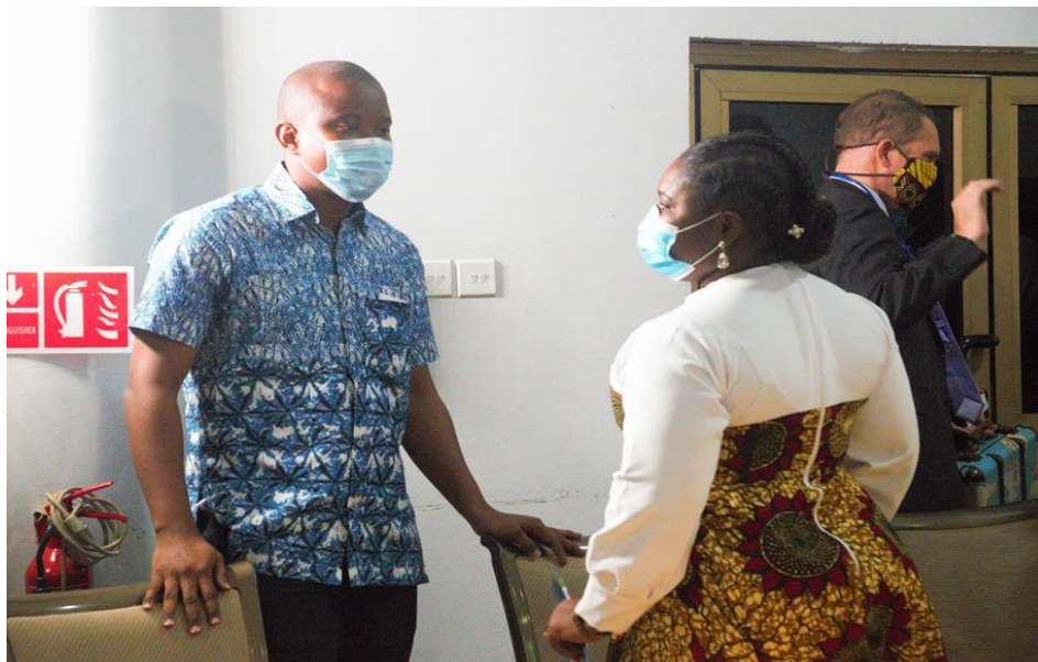
Figure 20: The CDO Director and the MCE of LaNMMA