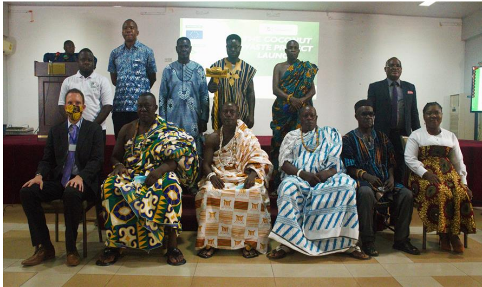
Figure 19: Dignitaries at the launch