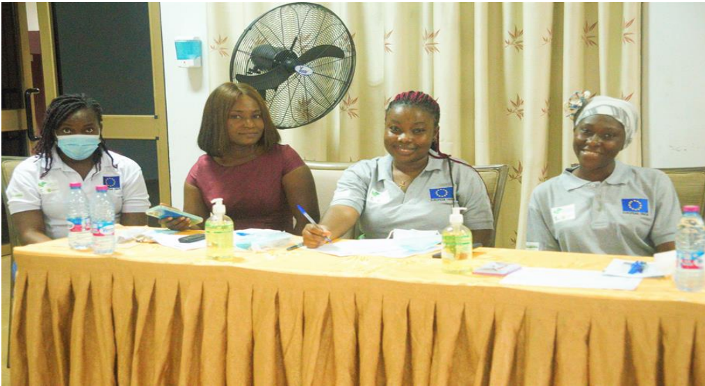
Figure 21: Some CDO team members