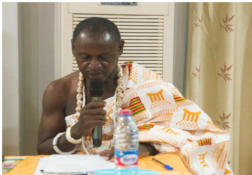
Figure 9: Chief of Danfa traditional council

coconut waste. He also noted that the Coconut Waste Project and its focus on sanitation and creating jobs for the youth within the community is a timely intervention as it has originated at a time where leaders are seeking to address issues of waste management and youth unemployment in the municipality. He expressed his profound interest in the project and stated that COWAP will significantly contribute to the efforts of community leaders within the municipality in addressing sanitation issues and creating jobs. He further urged the implementing organizations to collaboratively work towards achieving the project goal and objectives and also called on relevant stakeholders to provide all the needed support to reach the project goal. He ended his speech by stating that the Danfa Traditional Council is honoured to support the goal of this project.