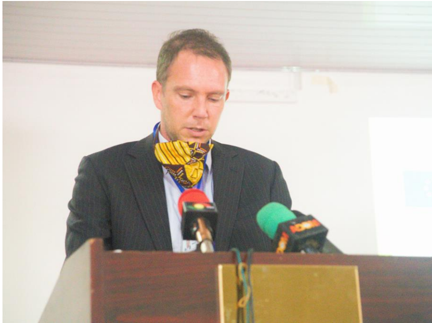
Figure 4: H.E Pieter SMIDT Van GELDER giving the keynote address